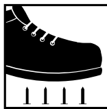
Product features reinforced midsole