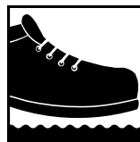
Product features anti-slip sole