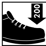
Product features 200J toe cap