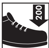
Product features 200J toe cap