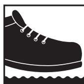
Product features anti-slip sole