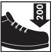
Product features 200J toe cap