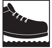
Product features anti-slip sole