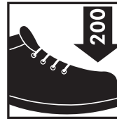
Product features 200J toe cap