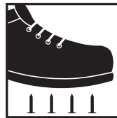
Product features reinforced midsole